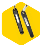
Steel core tire levers (2)