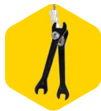
8/10mm and 9/11mm cone wrenches