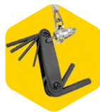
Hex key set

Public Repair Stands have nine essential tools for on-the-spot bike repairs