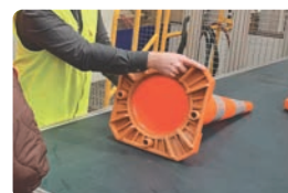
Better Cone made in New Zealand