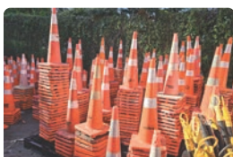
Old cones returned for recycling