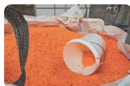
Cones are shredded