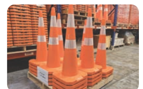
Purchase the Better Cone (2:1 see over)

Our 2:1 Programme is straightforward: For every 2x cones you recycle, you commit to purchasing 1x NZ-made Better Cone. By choosing Better Cones, you're not just meeting compliance requirements—you're actively contributing to a more sustainable road safety industry.