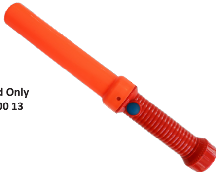
Red Only TP00 13